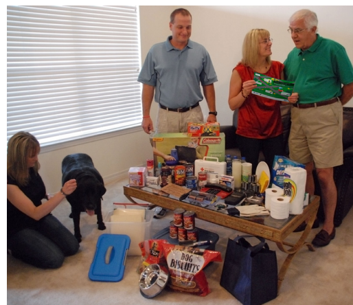
Prepare an emergency bag of personal items.

For more information and free fire-safety resources, visit www.usfa.fema.gov .